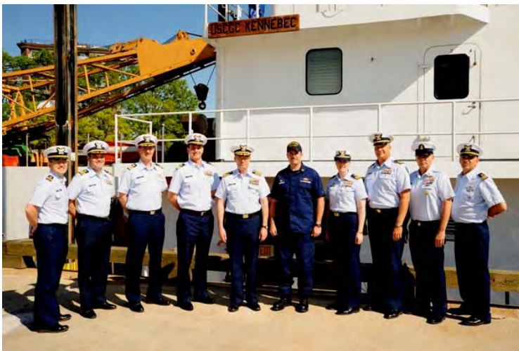
On Wednesday 14 April 2010, the Coast Guard Cuttermen's Association was created in a signing ceremony on the bridge of USCGC KENNEBEC, moored at the Washington D.C. fireboat pier.